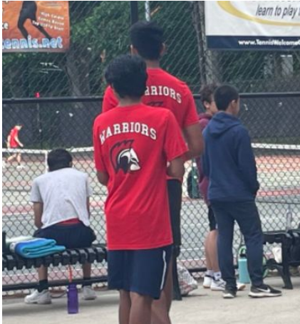
6/7: BHS Boys Tennis Match